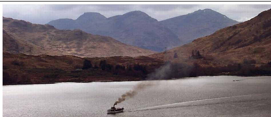
Loch Katrine, SS Sir Walter Scott and the Arrochar Alps

The name Loch Katrine is probably derived from the Gaelic “Cateran” which means “Highland Robber” and is said to be in reference to Rob Roy MacGregor though this is unlikely as the loch was named prior to the birth of Rob Roy. Rob Roy was born in Glen Gyle and was one