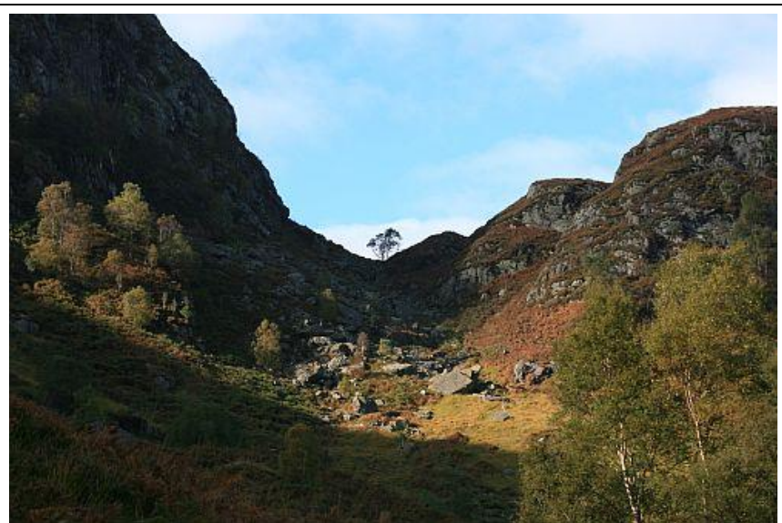
The Bealach Nam Bo (Pass of the Cattle)

At the west end of Loch Achray find a car park about 100 yards south of the turn off for Loch Katrine pier. A steep path leads off behind the car park and takes you to a small car park beside the private road leading to the Loch Katrine dam. Follow this private road and after about ½ a mile look for a narrow track on the left leading to an arched timber bridge over some waterfalls. Cross the bridge and continue to a forest road where you turn right. Continue on this forest road then onto a footpath